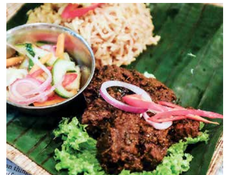
The Angus Beef Brisket Rendang

Lot H-1, Taman Tunku, Off Langgak Tunku, Bukit Tunku, Kuala Lumpur. Open on Tuesday - Sunday from 11:30am to 5:00pm; 6:30pm to 10:00pm Contact us • 603 6206 8111 Visit its Facebook page at www.facebook.com/kennyhillsbakers