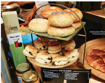
The Bistro's Burger