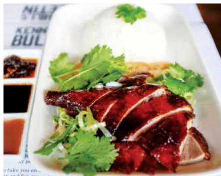
Crowd-Pleasing Rendition of Roast Duck Rice