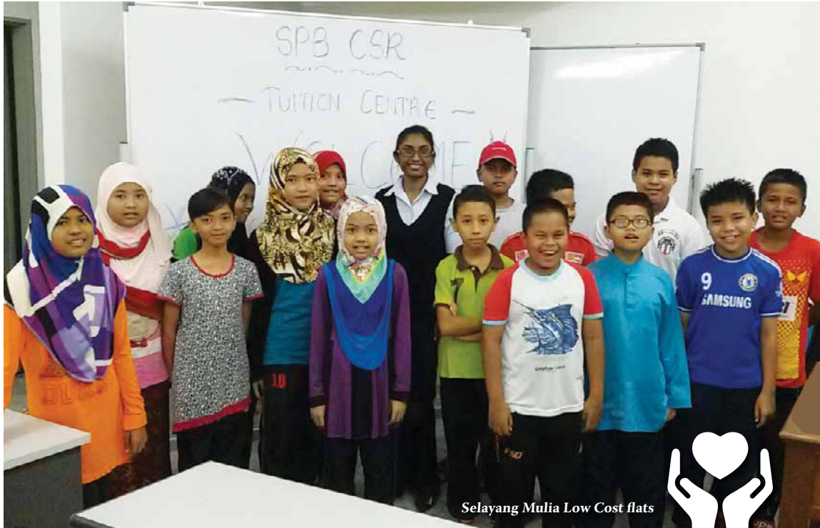
Selayang Mulia Low Cost flats

SMLC comprising of 744 units of flats and 44 units of shop lots were completed and handed over to purchasers in 2008. Over the years, the conditions of the flats have deteriorated. Being a developer that prides itself in providing residents with a good living environment, upgrading works were made to the lifts and staircase railing in order to ensure the safety of our residents. In addition to that, street lamps were also installed. We aim to improve the overall environment and well-being of SMLC.